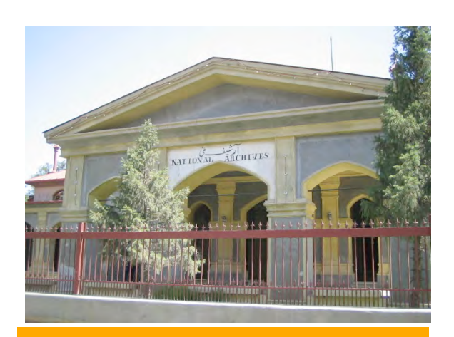
National Archives, entrance (above); rear view (below)